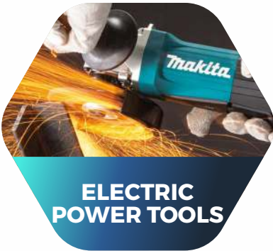
ELECTRIC POWER TOOLS

Whatever your job, Tool & Fastening World has the tool for you. We stock and sell the following: