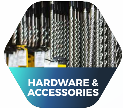
HARDWARE & ACCESSORIES

Hand tools have been around for thousands of years and with good reason. Even the most experienced tradesman knows that the simpler the tool required, the quicker the job. What can't be done quickly by hand can be handled in an instant by many of the hand tools we have available for sale.