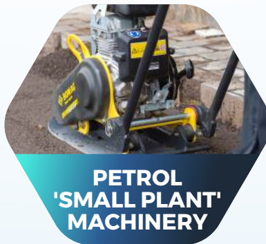
PETROL 'SMALL PLANT' MACHINERY

For all trades projects, quality fixing and anchoring solutions are central to the integrity of your build. And you need construction fasteners that will stand the test of time. Also, a partnership with a knowledgeable and supportive supplier is extremely important for the success of your business.